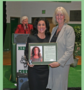
Inductees into the "Hall of Fame":